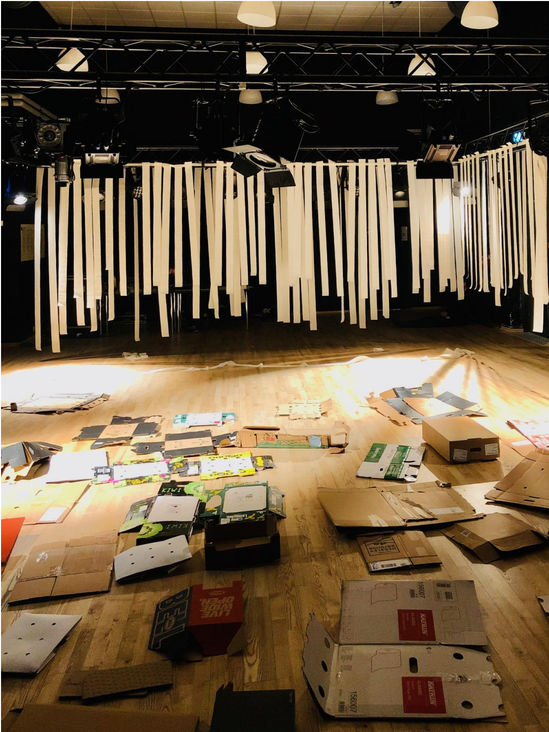
An example of the starting set-up, photo taken at Blackbox CPH 2023.